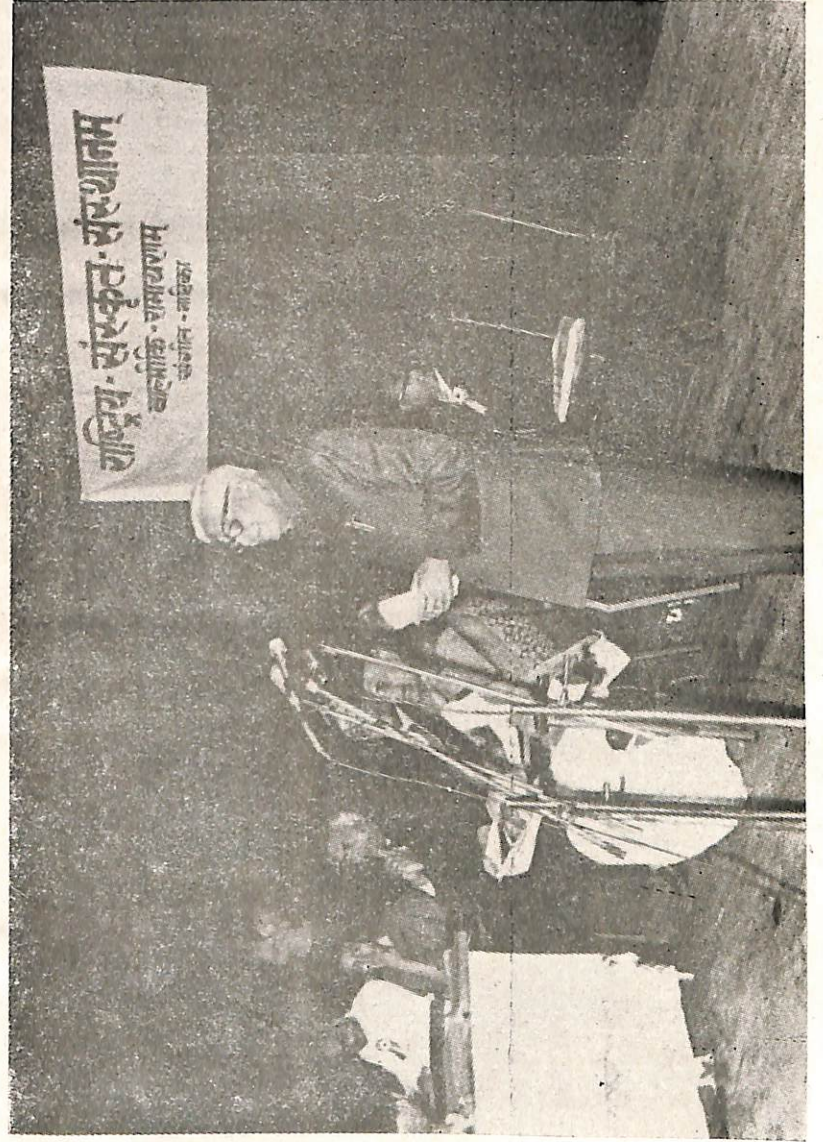
Sri R. Venkataraman, inaugurating the Dance-Drama organised by Sansthan,

There have been a persistent demand from State Government for the establishment of Kendriya Sanskrit Vidyapeethas under the auspicious of the Rashtriya Sanskrit Sansthan. The Government of Madhya Pradesh has agreed to provide a