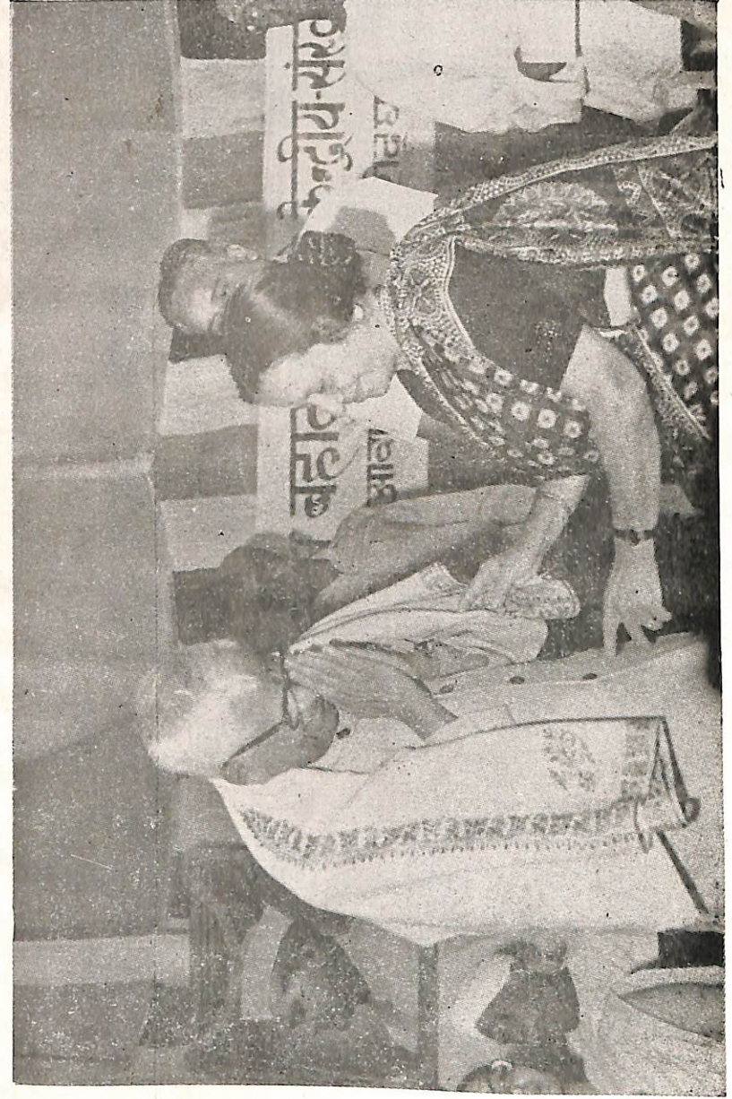
On the occasion of the inauguration of Delhi Vidyapeeth's residential complex. Smt. Shila Kaul, Minister of State for Education, honouring the Vice-President by offering shawl.

As a result of sustained research over the last several years a glossary of Punjabi and Sanskrit was completed during the year and sent to press. The students of the Vidyapeetha presented second act of the drama 'Mrichchakatikom' and a dance drama based on Geetagovinda during the inter Vidyapeetha Youth Festival held at Puri.