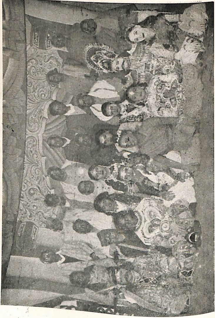
Artists along with the guests in the Inter-Nigyaneeetha youth festival organised by Sanathan