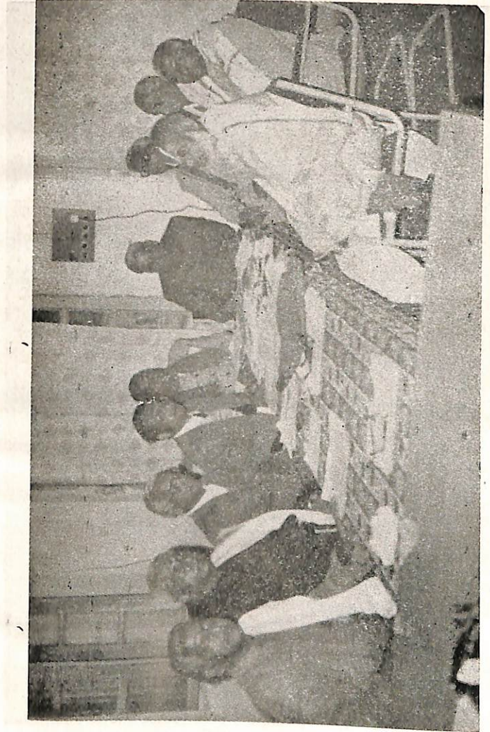
A conference of the Principal of the Vidyapeetha under Sanssthan.

It was in 1971 that the former Sri Sadasiva Sanskrit College, Puri functioning under the Government of Orissa was taken over by the Rashtriya Sanskrit Sansthan and re-named