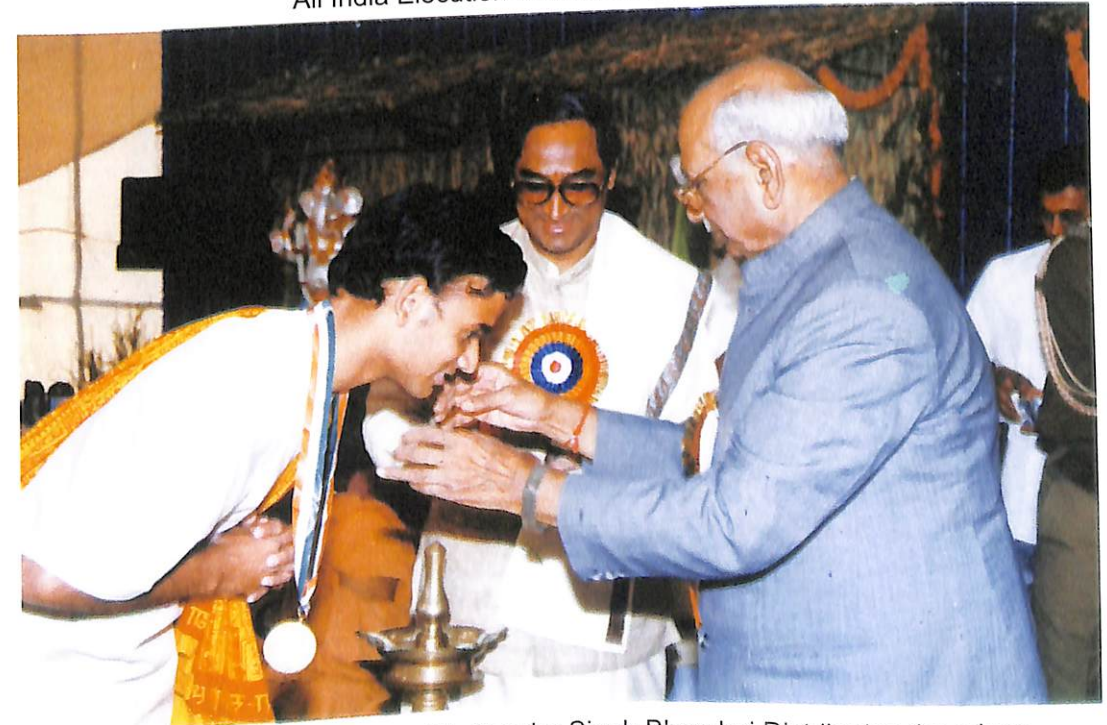
Hon'ble Governor of Gujrat Sh. Sunder Singh Bhandari Distributing the prizes.