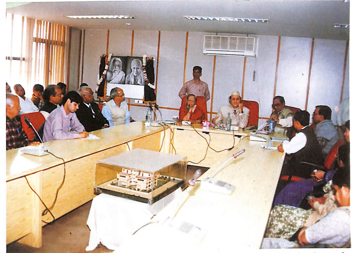
Dr. Karan Singh delivering his lectures in the conference room after unveiling the photos of Shri Aurovindo & Shri Mother.

Hon'ble Ex-Education Minister Dr. Karan Singh visited Rashtriya Sanskrit Sansthan, New Delhi on 27th March 2001. In his honour, the photos of Shri Aurobindo & Shri Mother were unveiled in the Conference Room by Dr. Karan Singh, a book consisting of 102 bio-dates of Honoured Sanskrit Scholars during Vidwat Samman Samaroh (Held on 28 March 2001) were inaugurated by Hon'ble Dr. Karan Singh on this remarkable day.