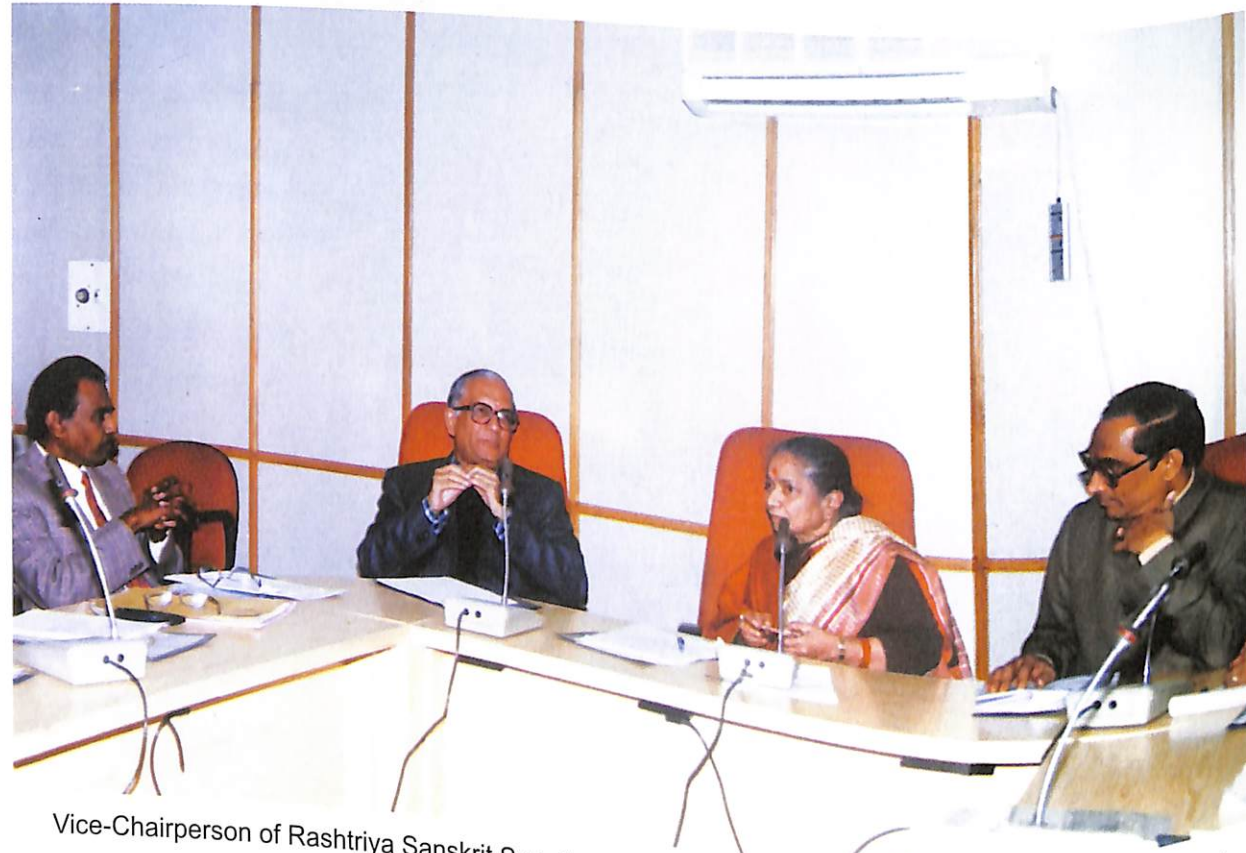
Vice-Chairperson of Rashtriya Sanskrit Sansthan & Director of Rashtriya Sanskrit Sansthan with the officers of CPWD meeting held on 29.01.01