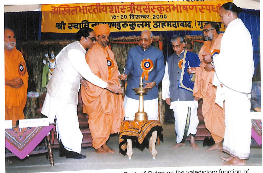
Lighting the Lamp by the Governor, Govt. of Gujrat on the valedictory function of All India Elocution contest on 20 Dec. 2000.