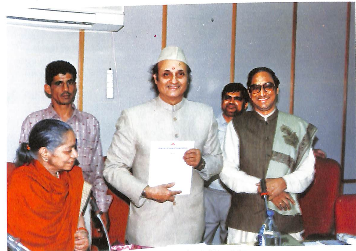
Dr. Karan Singh releasing the book Vidwat Sammananam.