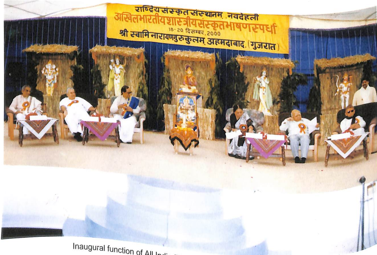
Inaugural function of All India Elocution Contest on 18 Dec. 2000 at Sh. Swaminarayan Gurukul, Ahmedabad.