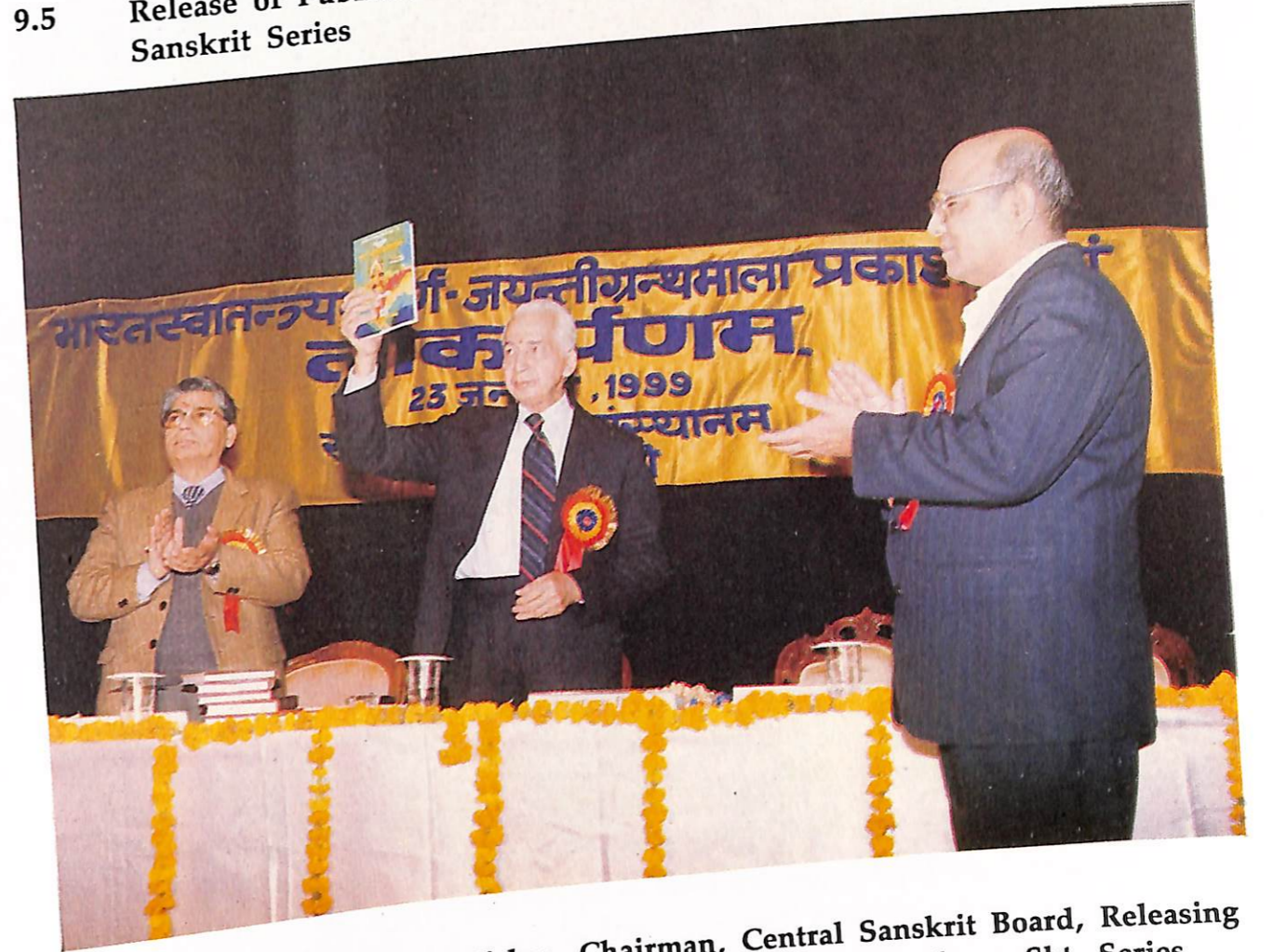
Hon'ble Sh. Ranganatha Mishra, Chairman, Central Sanskrit Board, Releasing the publications of Golden Jubilee of India's Independence Skt. Series.