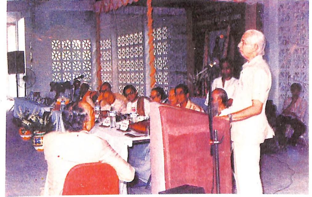
Chief Guest of the function – Hon'ble Justice Sh. Ranganath Mishra, Chairman, Central Sanskrit Board, addressing the gathering.